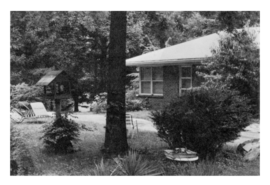
The exterior of the Ra room: the door and corner windows are part of the outside of the room in which the Ra sessions have taken place since January 1981.