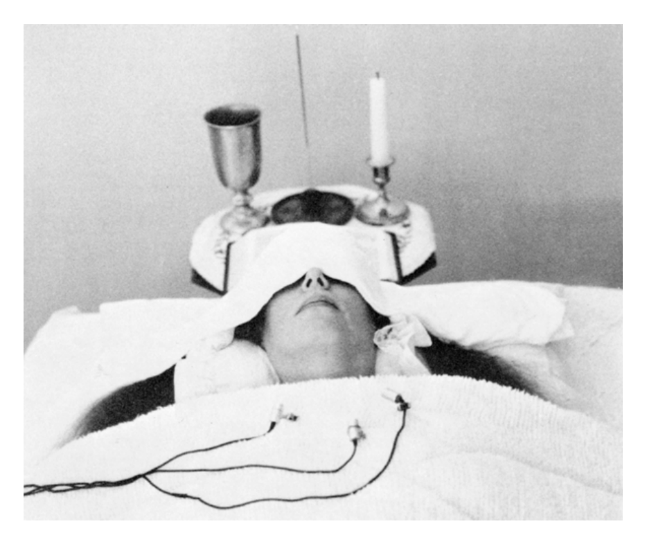
RA, Session No. 2, January 20, 1981: "The instrument would be strengthened by the wearing of a white robe. The instrument shall be covered and prone, the eyes covered." ( Photo taken June 9, 1982. )